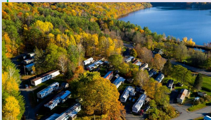
Enfield, NH

We are also undertaking multiple surveys. Some are to learn more from a particular group of stakeholders, such as employers, while others are to hear the opinions and stories of residents. Presently, we are asking our region's municipal staff and volunteers (e.g. planners, planning boards, zoning administrators, town managers) to share