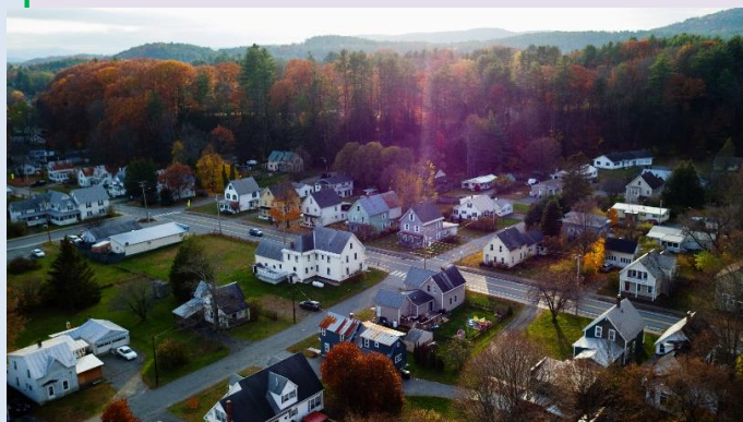
Wilder, VT

how infrastructure connects to their communities homes, current and future.