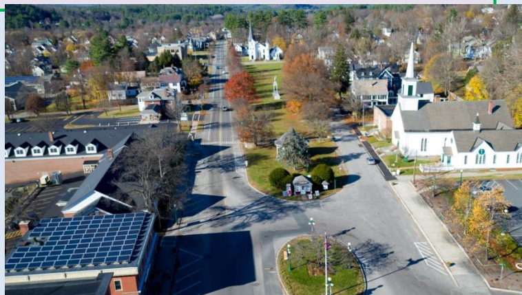
Newport, NH