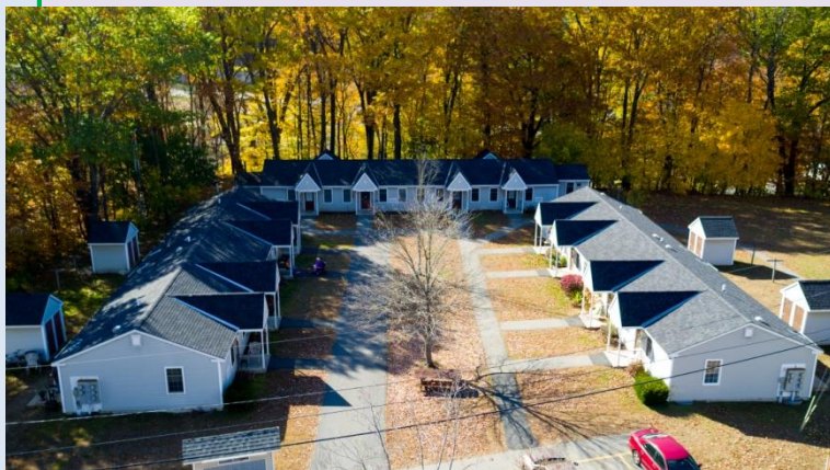
Springfield, VT